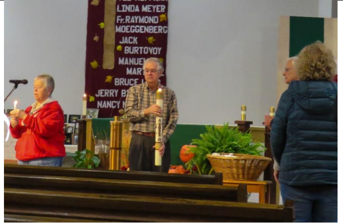
(Remembering Departed Loved Ones)