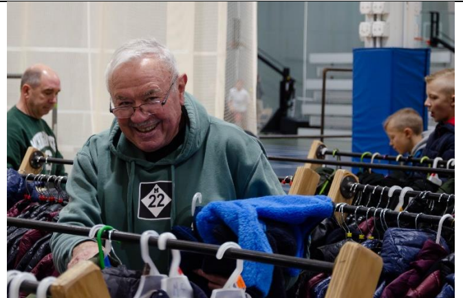
(Setting up coats at Christmas Outreach)