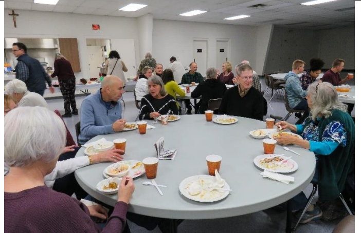
(Enjoying great food and socializing)