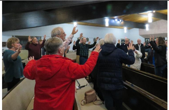
(Sharing the Saginaw Blessing)