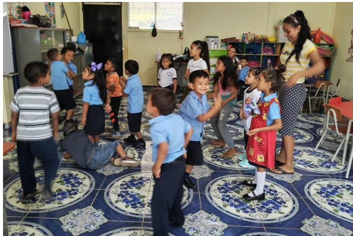
(Kindergarten class at Guajoyo School)

The next project for the school is the construction and furnishing of a dedicated pre-school play area. This project will cost $7,831 and serve about thirty-eight kindergarteners per year.