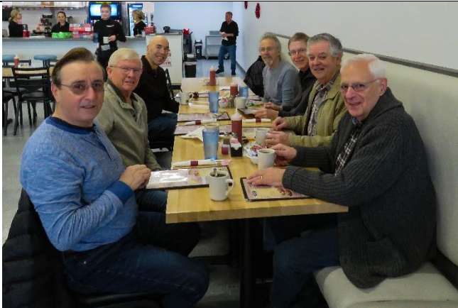
(The men's breakfast group)