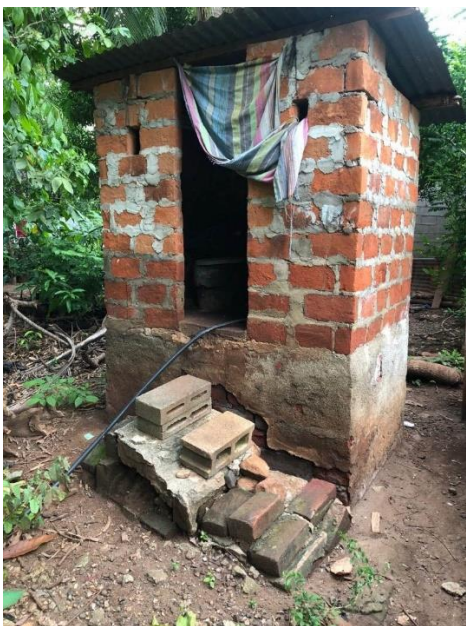
(Poor condition of some latrines in Miramar)

With a recent earmarked gift of $10,125 from the Cebalak Foundation of Grand Rapids, the Committee is assisting the community of Miramar to upgrade sanitary conditions and protect its potable water supply by constructing twenty-five concrete-block, composting latrines. Currently fifteen families have no latrines and ten have older, badly damaged ones.