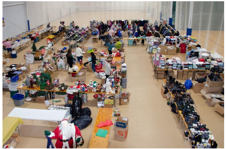
(All Stations Ready for Distribution)

Five hundred and sixty-one families registered with Christmas Outreach this year. Collectively these families received over 1,700 coats, 500 snow pants, and 525 bins filled with paper products and cleaning supplies. Every child received a book and a wooden toy. Every child and teen received a Christmas stocking filled with gifts, and adults with no children also received a stocking. Christmas Outreach gave away a large number of donated Christmas decorations including many, many artificial trees.