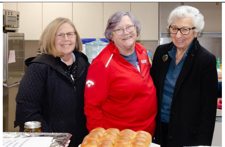
(Preparing dinner at the Restoration House)