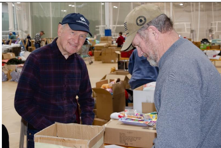
(Filling stocking at Christmas Outreach)