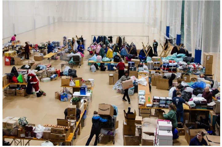
(Volunteers worked to setup Morey Courts)