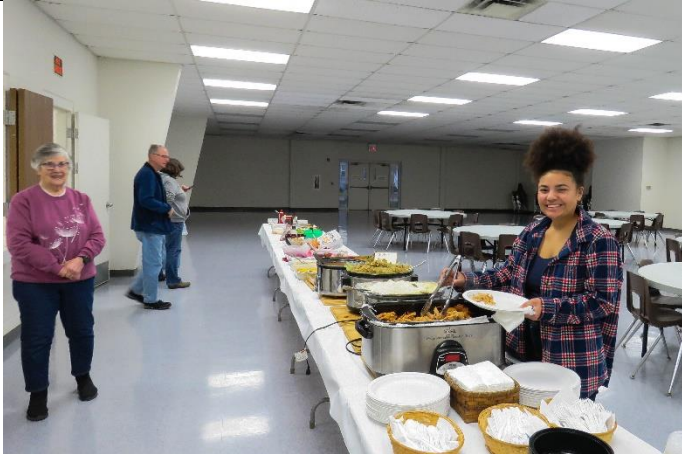
(Preparing to serve the meal after a service)