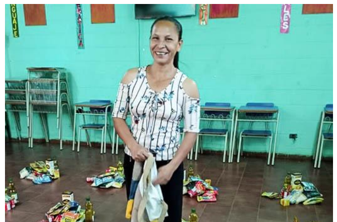
(Food packages being prepared for students)

Finally, the Committee is giving a $1,000 grant to the student emergency fund that was started last year. It will enable school leadership to make very small “on-the-spot” grants to students and families to address food security and transportation issues that too often keep kids from attending school. Dozens received support in 2021 through this new fund and continuing it is a priority.