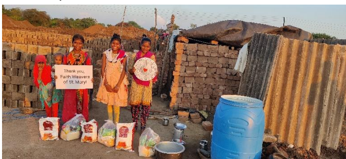
(Global Compassion distributed food to people experiencing food shortages due to the pandemic)