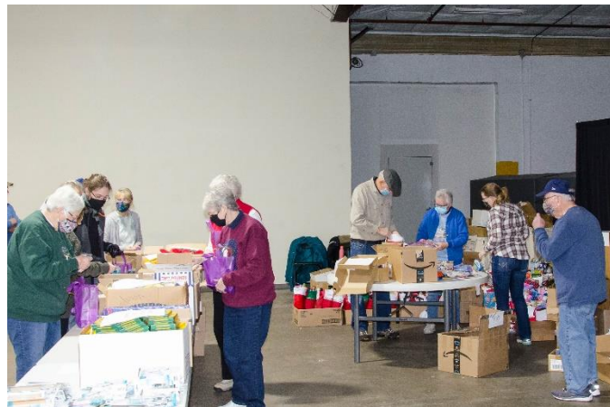
(Volunteers setting up for stocking distribution)

Christmas Stockings gave out stockings to 361 children and gift bags to 205 teens and 258 adults. Faith Weavers made financial contributions, purchased items for these stockings and gift bags, helped to fill them, and then helped to distribute them to families. We moved stored items to and from the Campus Crusade building.