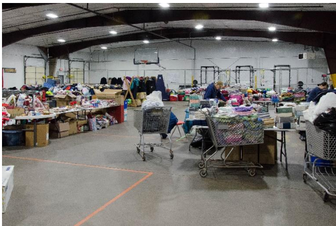
(Volunteers preparing the Campus Life Building for Christmas Outreach)

Many thanks to all of you for your support, again this year, for Christmas Outreach. We served 396 families, and a total of 1,342 individuals. It was great to be able to have clients come in person to select the items that best fit their families. We could not do it without the help and support of Faith Weavers.