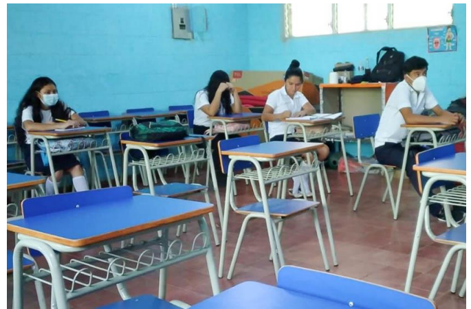
(Students in a refurbished classroom)

In addition to these physical improvements, the school’s miniscule expenses budget ($1,500 for almost everything for the year) will receive a boost of $1,000 specifically to purchase teaching materials, including basic items such as paper and pencils.