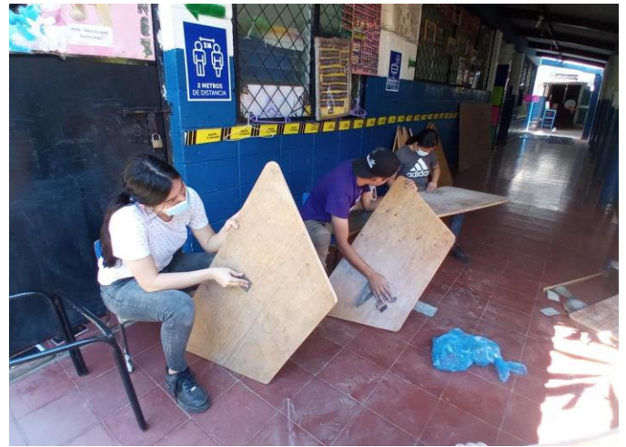
(Scholarship recipients repairing furniture at a San Pedro elementary school)

Students in the program are required to participate in a collective community project as part of a strong mentoring program that extends beyond academics. Last year's students repaired and refinished furniture at a San Pedro elementary school and shared with us a report highlighting the experience and results.