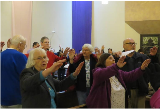
The Saginaw Blessing sung at our service