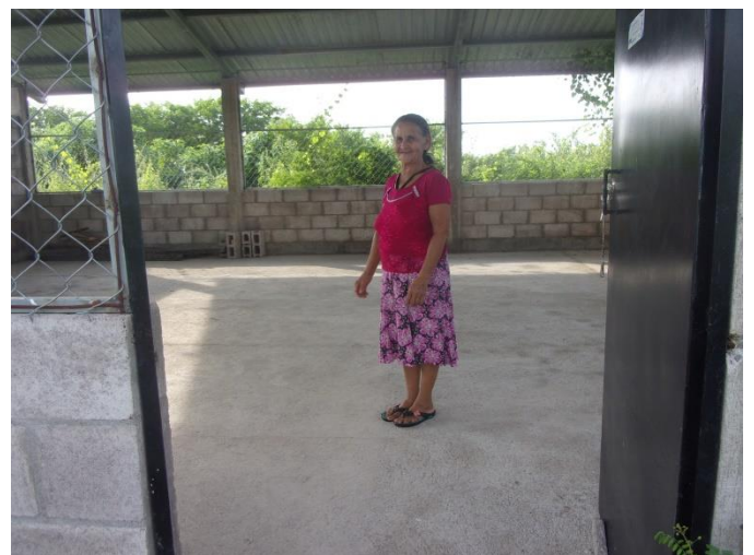
The President of the Llano Grande Community in a multi-purpose pavilion funded by the Committee