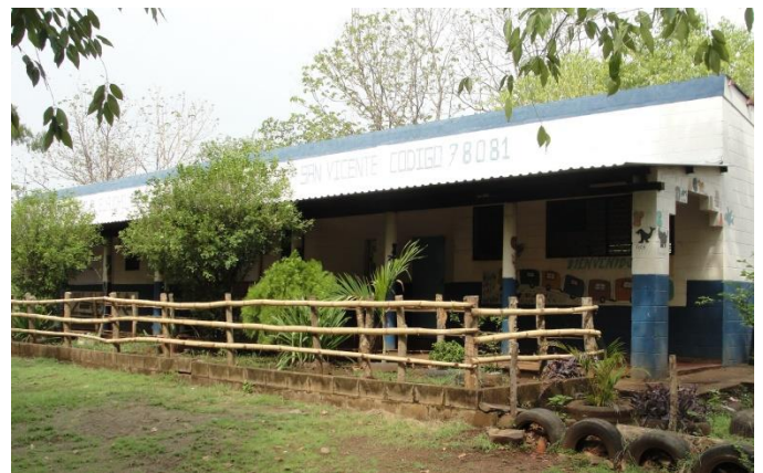
A Guajoyo School classroom building