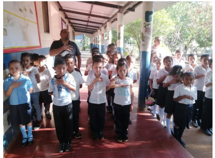
Guajoyo School Children Pledging Allegiance to the Salvadoran Flag

The visit team looks forward on return to reporting to the Committee and Faith Weavers on new developments and issues and on prospects for continuing to partner with rural residents to improve living conditions in their communities.