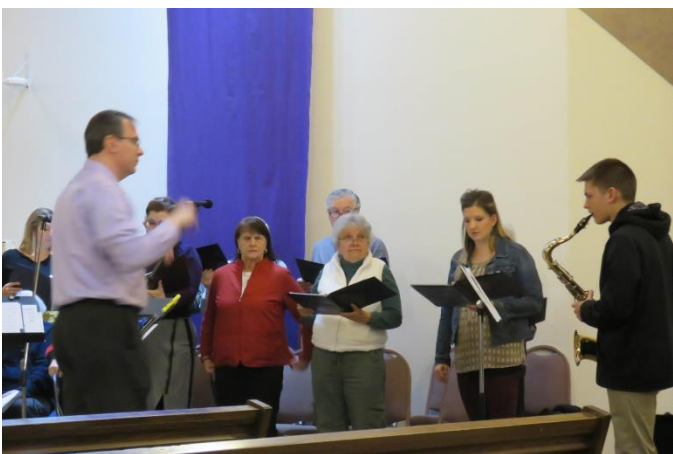
Choir praying though song at our services