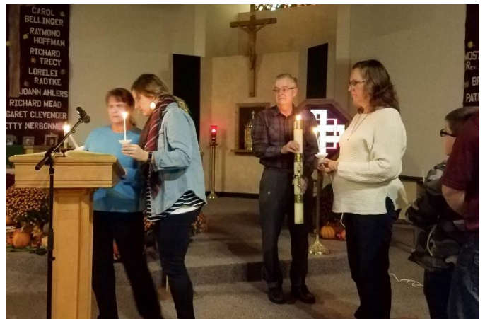
The Remembrance Service in November