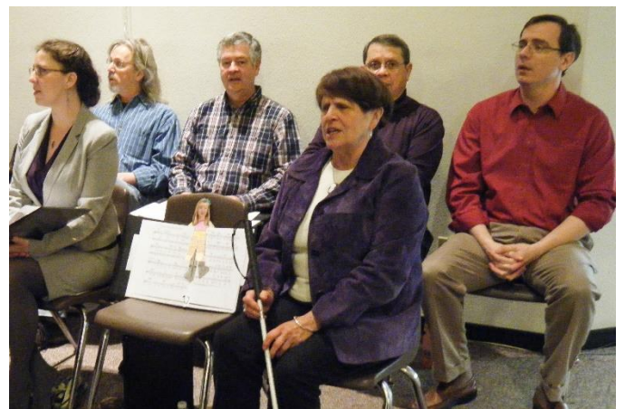
(Joining the bass section of the choir)