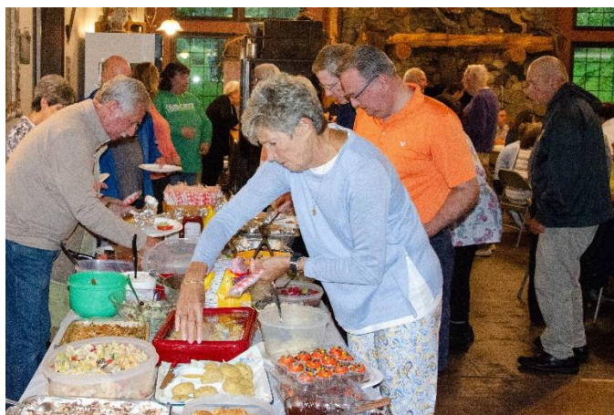
(Everyone participated in the feast of great dishes brought for our potluck meal)