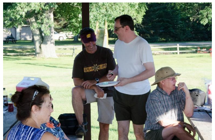
(Always supporting Faith Weavers events)