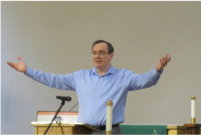
(Cantoring at Faith Weavers Services)