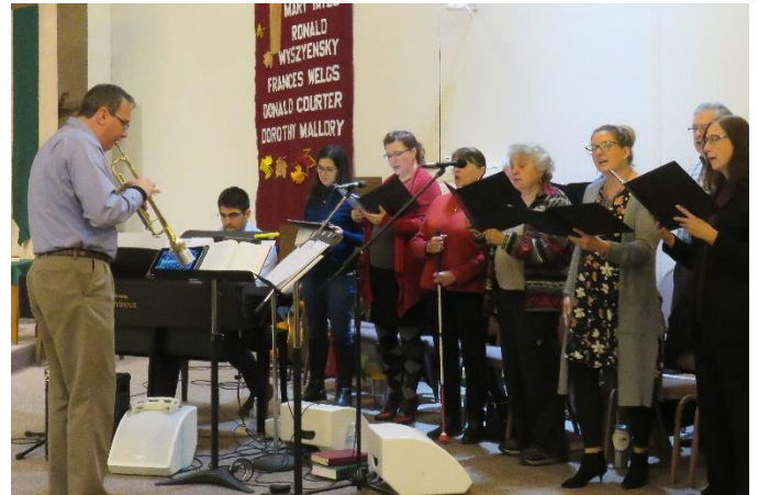
(Playing his trumpet while leading the choir)