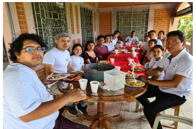
(Monthly Meeting of San Pedro Nonualco Scholarship Students.)