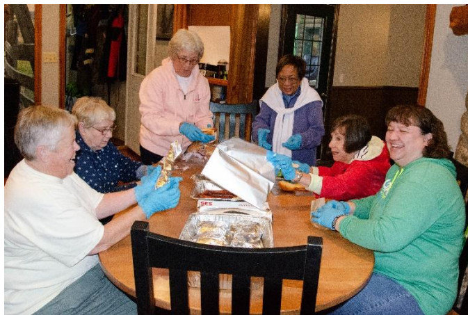
(The kitchen crew has way too much fun getting the burgers and dogs ready to eat)

Faith Weavers 16 th Anniversary Party was held at Sleepy Hollow Hide-a-Way on September 11th. This was the first time we had rain on the day of this party. The wet weather didn't dampen the fun with many Faith Weavers coming to celebrate. Friends gathered to enjoy lively conversation, delicious food, and lots of laughter.