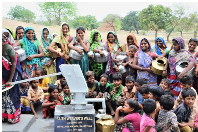
(Faith Weavers supported well drilling in 2018)

Now, its outreach has expanded to a worldwide family and over the years, Global Compassion Inc, has raised and distributed over $1,500,000 through programs designed to provide basic needs like clean drinking water, to alleviate suffering empower self-sufficiency and promote education.