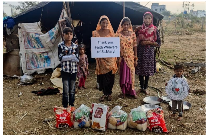
(Food Distribution during the COVID-19 in 2020-2021)

Faith Weavers grant of $3,000 in 2022 was given to Global Compassion Inc, to support 50 leprosy families in the state of Andhra Pradesh in India. Their existing mud huts with thatched roofs were damaged in the storm in late 2021 but now are repaired as shown in the photo. They were also provided with warm clothing, bed sheets, woolen socks, food packages and some basic medicines.