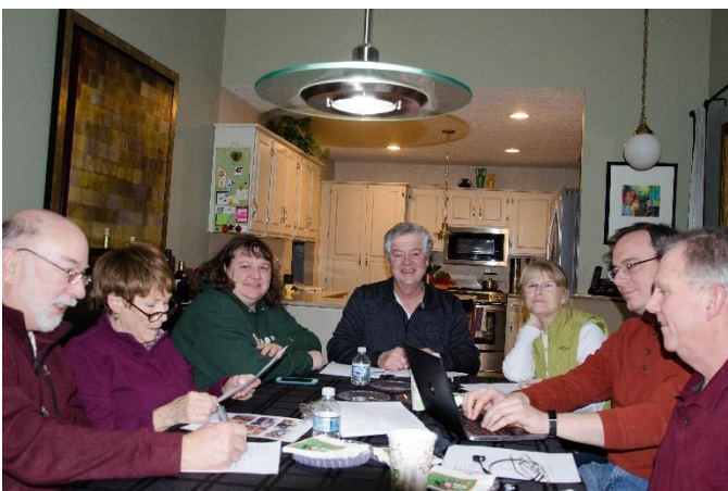
(Valued member of the Communication Committee)