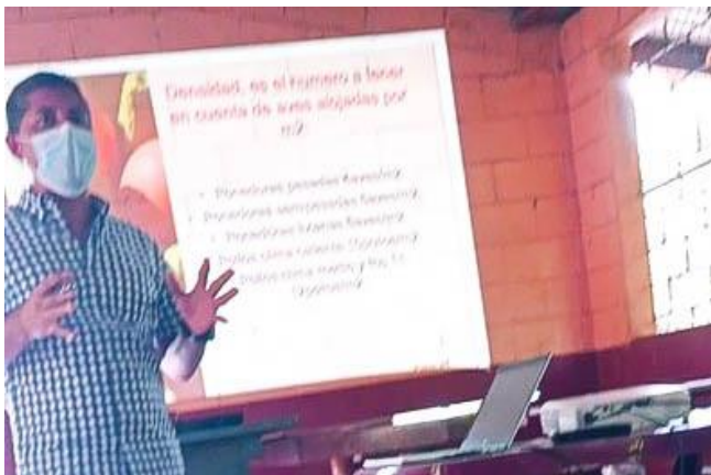
(Poultry Project Training Session in Miramar)

The Friends of El Salvador Committee provided $2,700 for a pilot project on raising poultry as a food source and income for families in Miramar. Fifteen families are participating in this pilot project, and, if successful, the remaining 29 families will participate.