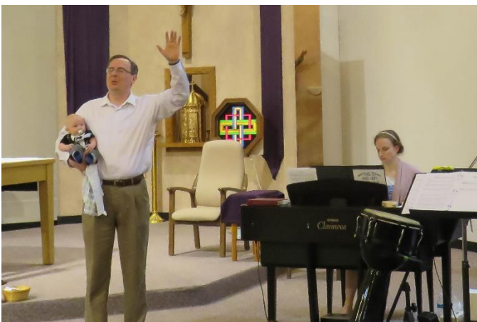
(Giving the Saginaw Blessing with a new choir member)