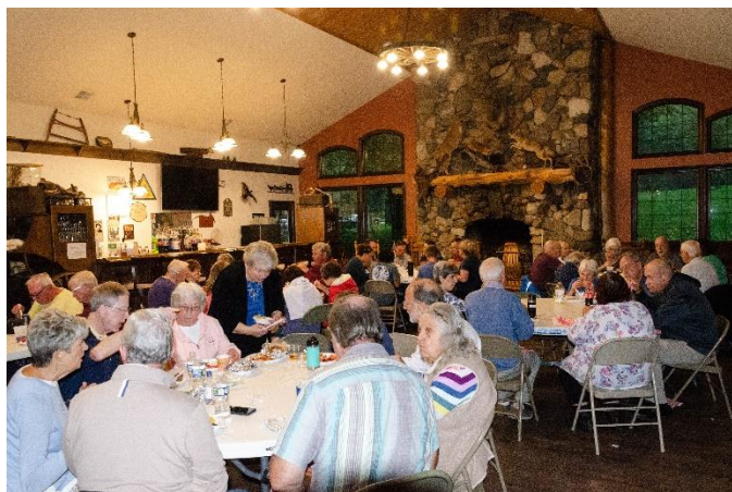
(Good friends and delicious food shared at table)