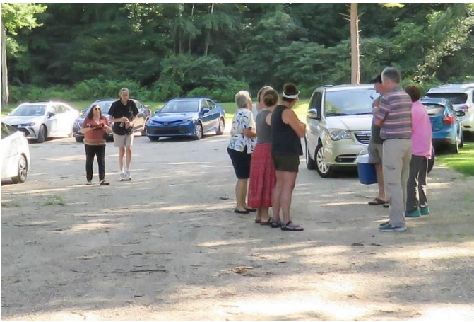
(Faith Weavers came together at our August party for the first time in a year and a half)