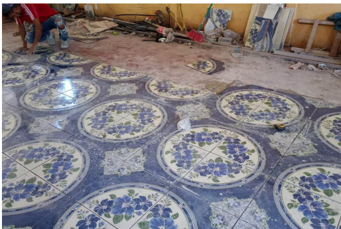
(New floor for Guajoyo School kindergarten room)

Guajoyo School Principal, Iris Cañas, requested funds to renovate the kindergarten classroom, purchase new furniture for other classrooms, and initiate a student education fund. The renovation of the kindergarten classroom included replacing the ceiling, lighting, and furniture as well as adding a tile floor. This project is finished and cost about $7,000.