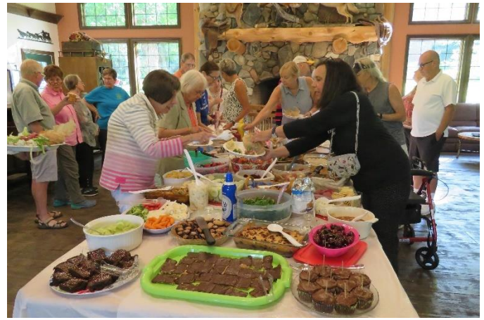
(Everyone participated in the feast of great dishes brought for our potluck meal)