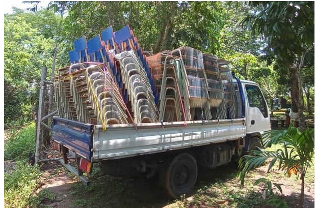
(Classroom furniture arrives at Guajoyo School)

Classrooms for grades 1-9 also got new furniture. Ceiling fans were installed in one of the buildings, and water coolers were purchased for each of the school buildings. The cost of these additions was approximately $12,600.