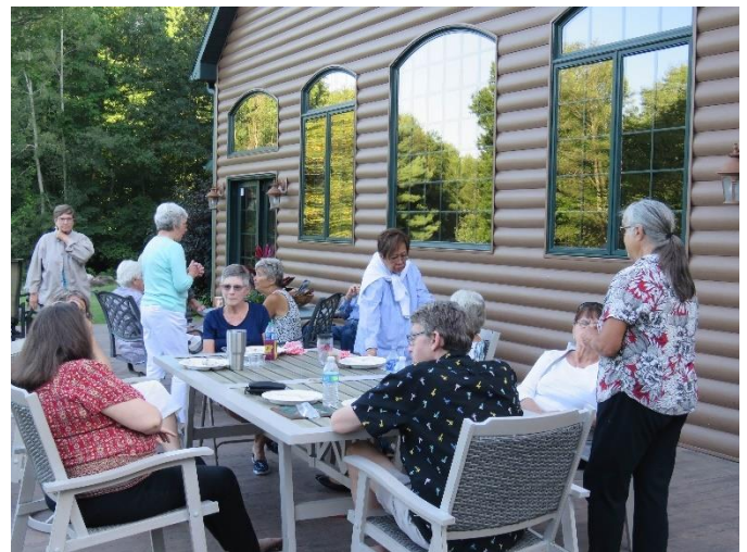
(A warm summer day was enjoyed at the lovely Sleepy Hollow Hide-a-way)