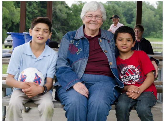
A time for family. 2015