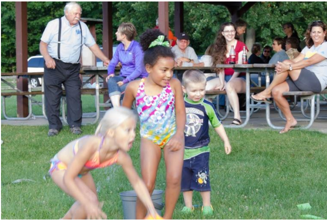
Pitching wet sponges is lots of fun. 2014