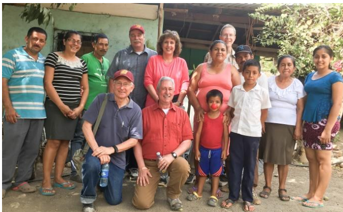
Miramar Directiva with the Friends of El Salvador