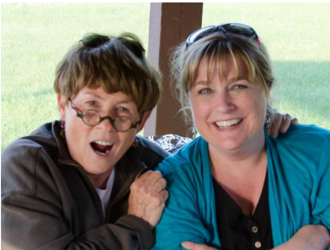
A time for friends. 2014