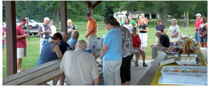
Giving thanks for all our blessings. 2012