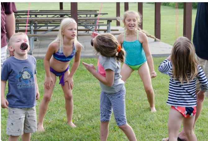
Donuts on a string, what fun! 2015