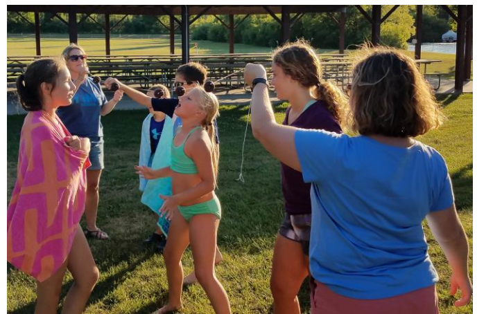
Donuts continue to be a hit! 2017