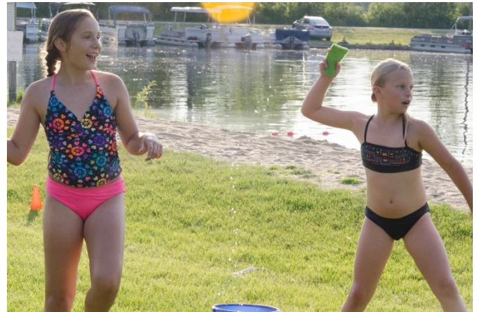
The wet sponge games remained a favorite. 2017