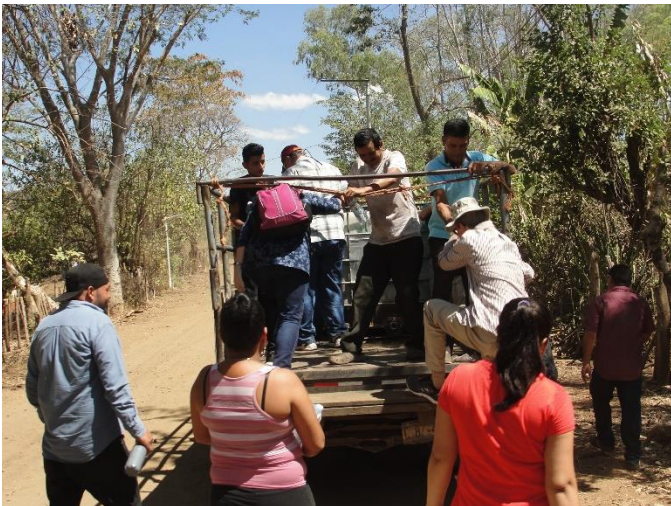
Community members tour the fire damage near Miramar.

A wildfire occurred in cultivated land near Miramar just prior to the Friends of El Salvador delegation’s arrival in March. At least hundreds, probably thousands, of recently planted cashew, cacao, and mango trees were destroyed or damaged.