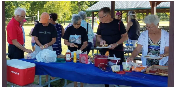
Enjoying all the great picnic dishes. 2018