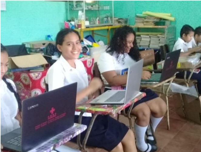
Students using computers at Guajoyo School.

The Guajoyo School was given $5,800 for the purchase of computer equipment. They purchased eight computers with wireless capacity and four LCD screens. The school is using this equipment, along with computers purchased through a government grant, to teach students computer skills, as well as academic subject matter. Teachers would like students to use the computers in classroom presentations, and to access the Web. The school is scheduled to get an Internet connection soon.