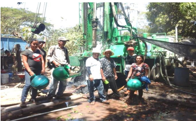
Community members at the drilling site.