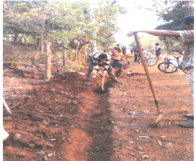
Miramar residents digging trenches for the water pipes.

The residents of Miramar have donated their labor, with over 3,182 labor-hours given to this project. Residents donated their time to guard the drilling equipment from theft or damage; individuals dug 500 meters of trenches, and laid the pipes to carry water from the well to Miramar, and they constructed the concrete-block hut to enclose the well pump.