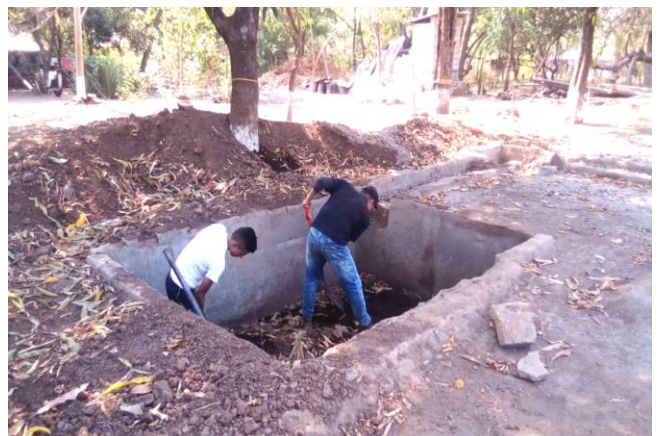
Preparing the foundation for the hut over the well.