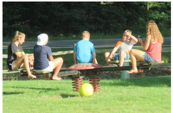
Good friends getting together.