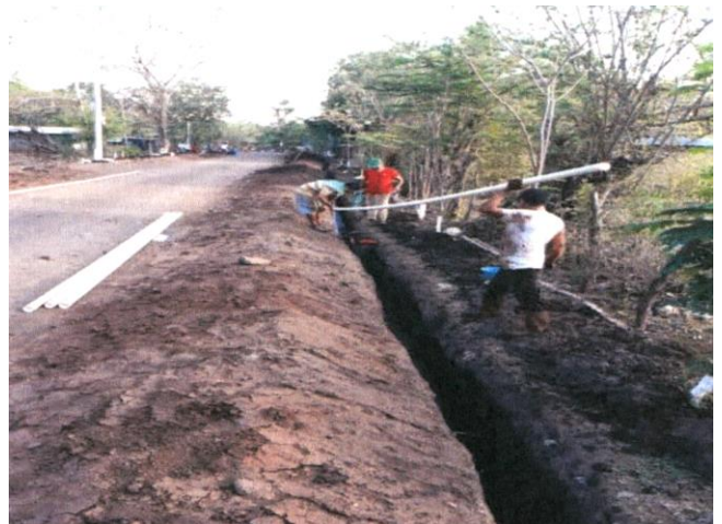
Laying pipes in the trenches.