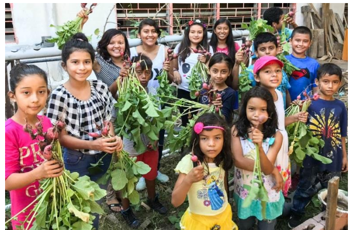
Children at Puerto de La Libertad with their harvest.

This project, recently undertaken with Committee funding at an after-school program operated for kids in Puerto de La Libertad by the Great Commission Latin America, has harvestable produce! In the fall the kids planted and tended the garden, and recently they've begun enjoying vegetables as part of their daily snacks.