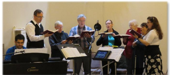
Choir singing for the January Service.