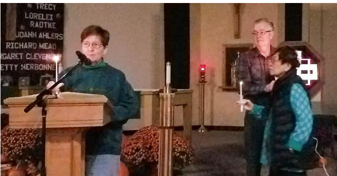
Remembering our departed loved ones at our November Service.