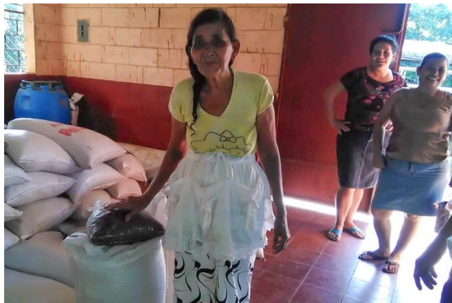
Residents of Miramar receive a shipment of rice and beans to supplement their food supplies after a poor harvest.

The money you donate goes to improving the lives of the Salvadorans by providing repairs and enhancements to the community infrastructure and supporting the education of youth. For example, in 2015 grants were given to the Guajoyo School to paint the school and to repair classrooms, roofs, ceiling and bathrooms and provide educational equipment and instructional materials for science and math education. We also provided funds for new costumes for a school folkloric dance troupe.