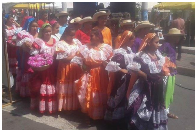
Students in the folkloric dance troupe at Guajoyo School perform in the costumes donated by Friends of El Salvador.

In 2016 we are looking forward to enhancing reading skills by providing Kindles for classroom use. Also this year we're considering funding furniture and equipment for the kindergarten as well as for improving physical education and recreation facilities.