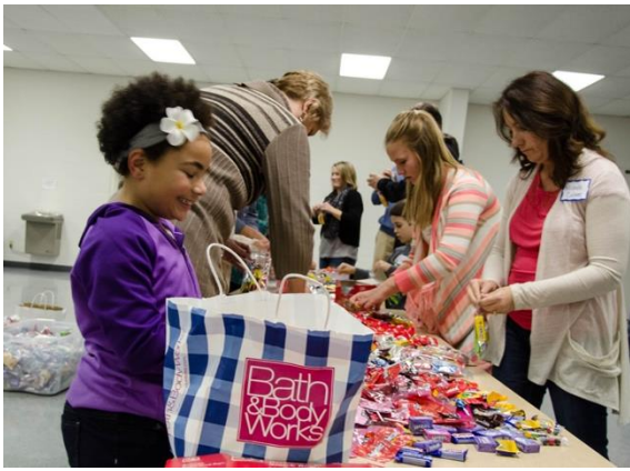
Faith Weavers filling Christmas Outreach candy bags.

Christmas Outreach 2015 is now a memory, but a wonderful memory. Faith Weavers once again came through in a huge way to make the Christmas Stocking Project a huge success. We prepared and gave out about 1,000 stockings and gift bags through Christmas Outreach.