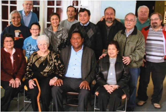
Mexican American Council after mass during a Novena to Our Lady of Guadalupe

We like to focus on the work of organizations supported through grants from Faith Weavers. This article describes the work of the Mexican American Council located in Saginaw.