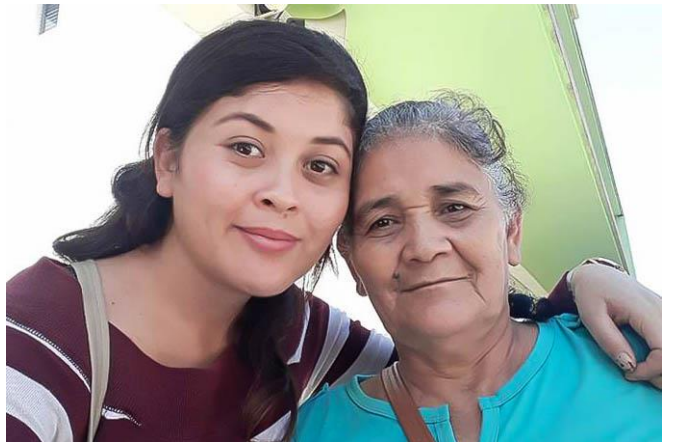
Students at the Guajoyo School