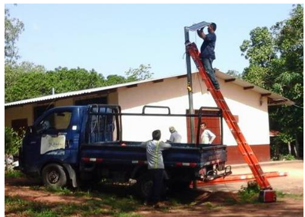
Miramar Solar Lamp Project

In Miramar the solar lighting project funded last December, implementation of which is just about complete, is already being regarded by the regional government and by other local communities as a model of sustainable enhancement of security. Twenty lamps on poles are beginning to light common areas and key sections of paths in the community. This project is valuably combining with other programs, such as a government-supported reforestation project as well as major agricultural improvements, impressively advancing conditions in the community.