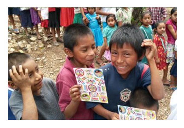
(The children of Ostuman)