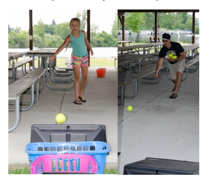
(Who has the better form?)