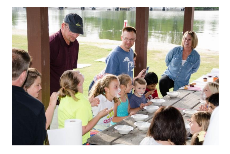
(Diving for candy is always a hit)

The 8<sup>th</sup> Annual Tornado Picnic was a huge success with about 40 people enjoying a beautiful summer evening with good food, good friends, and lots of fun and games.