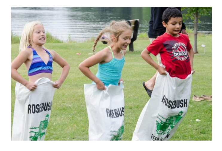
(Sack race is a challenge)