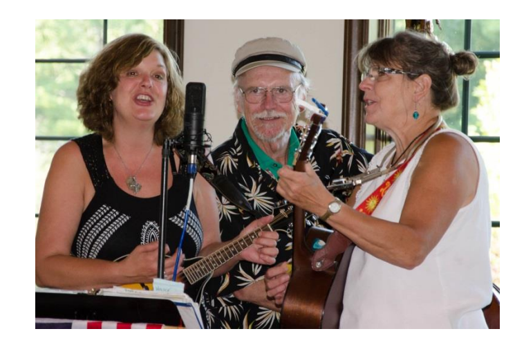
(Sunshine String Band entertains after the meal)