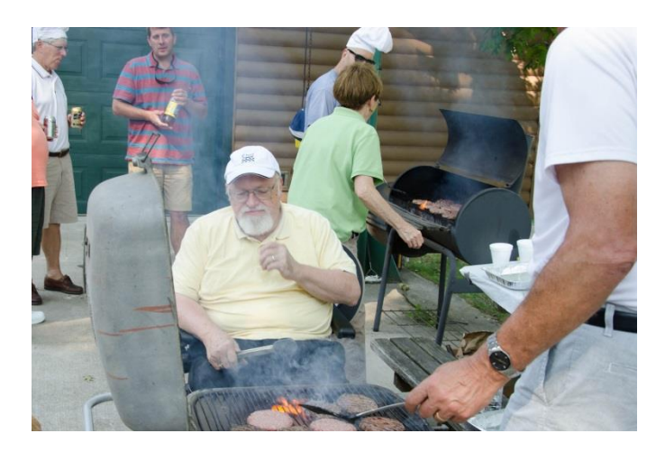
(Chefs prepare delicious flaming burgers)

Ninety people enjoyed the party. . Everyone enjoyed the beautiful summer day with good food, lots of laughter, and socializing with friends. The Sunshine String Band provided music for us. Thanks to everyone who volunteered their time and talents to make the party a success.