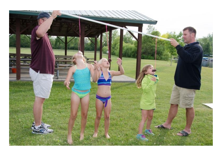
(This is the way to eat donuts)

The 8<sup>th</sup> Annual Tornado Picnic was a huge success with about 40 people enjoying a beautiful summer evening with good food, good friends, and lots of fun and games.