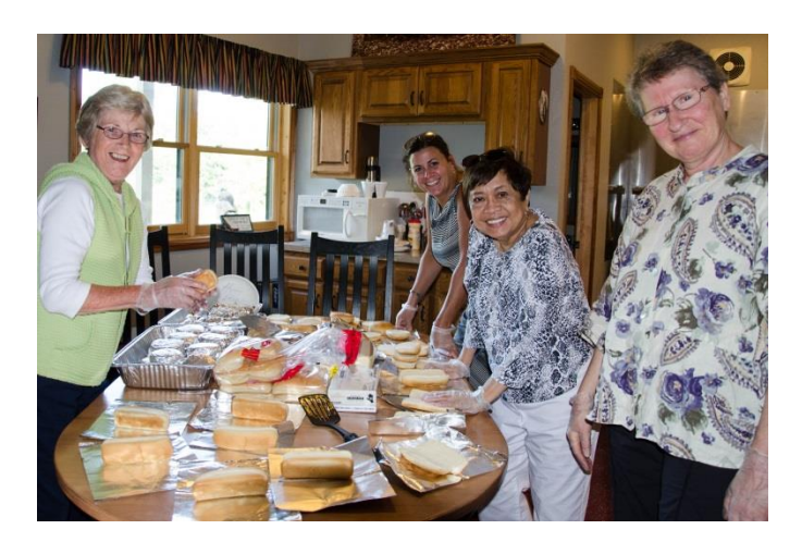
(Kitchen crew prepares the burgers and hot dogs)