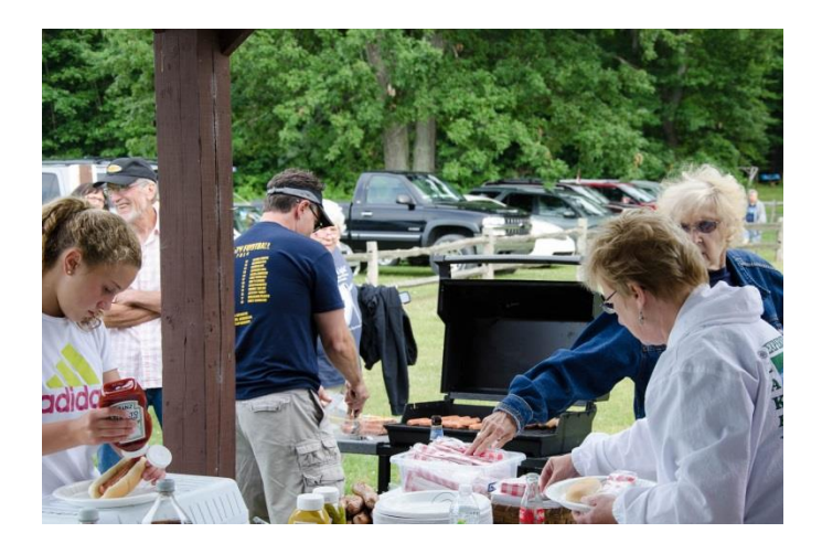
(Good food and good friends)

Pictures from the July 8th Tornado Picnic