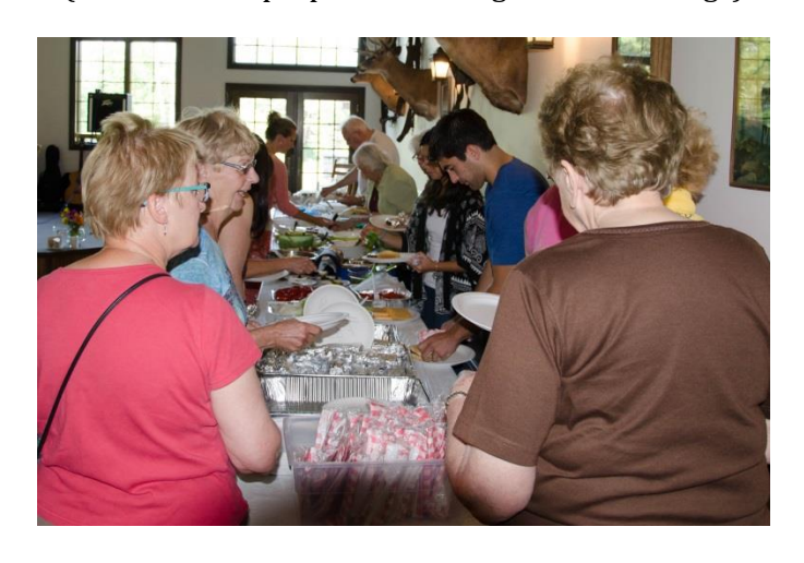
(Everyone enjoys the feast)