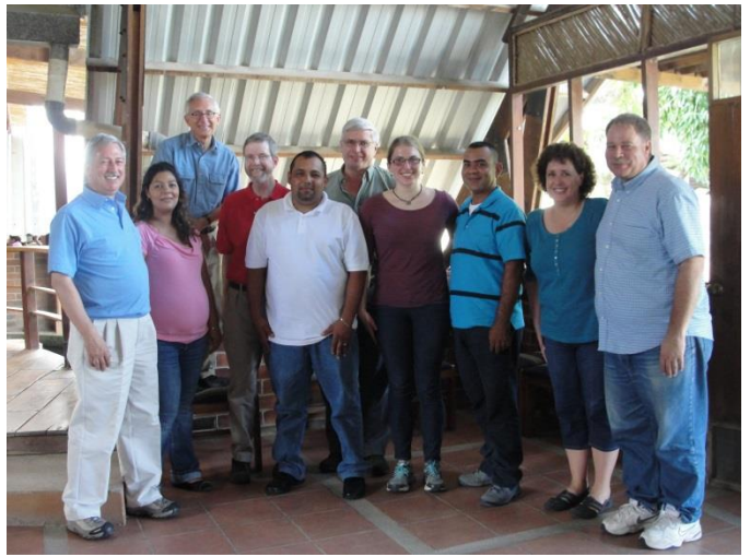
(Delegates with teachers at Guajoyo School)

A delegation from the Friends of El Salvador visited communities in El Salvador the week of November 8, 2014. While there they met with representatives from CRIPDES, San Vicente, a non-governmental organization with whom we partner; the Directiva (Council) of Llano Grande II, a village we're supporting with infrastructure projects; teachers from the Guajoyo School for which we support educational programs; and, of course, the Directiva of Miramar, the community we befriended many years ago.