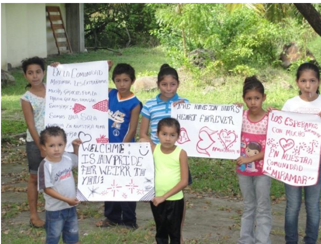
(Greetings from the children of Miramar)

Committee members will meet this winter to select projects to fund in 2015. They'll use the information gained from the delegates visit in November along with other reports and requests from communities and groups in El Salvador in making their decisions.