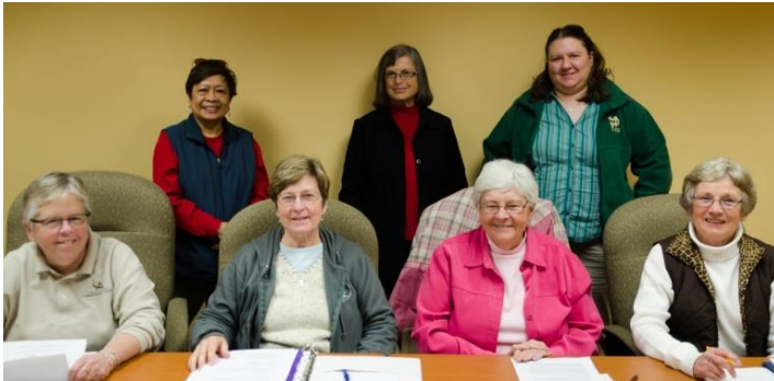
Service and Justice Committee Members

The Service and Justice Committee identifies and evaluates organizations requesting grants from Faith Weavers. The committee focuses on local charities, 82% of grants last year, but also considers national and international charities for grants. They also screen applicants for donations from the Faith Weavers' Endowment Fund and make recommendations to the Endowment Board of Trustees for gifts to specific charitable organizations. Meetings are held four times a year, or as needed, to select recipients for grants.