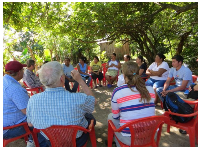
(Meeting with the Directiva of Llano Grande II)

This year's grassroots fundraising campaign brought donations of $10,640, which includes a grant of $1,200 from the Faith Weavers Foundation. In addition to the proceeds of the campaign, the committee also received a $2,000 grant from Blessed Sacrament Parish in Midland. What's more, the committee received a grant of $7,500 from the Cebelak Foundation of Grand Rapids through St. Vincent De Paul Parish in Shepherd. Together, these funds will be used to support infrastructure and educational projects in the San Vicente Region of El Salvador.